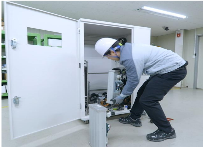
Machine part manufacturing (part placement, etc.)