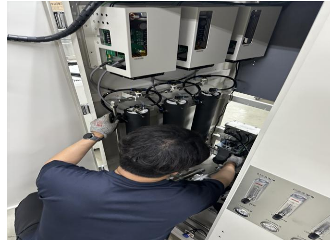
Machine part manufacturing (pipe connections, etc.)