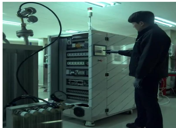
Electrical part manufacturing (control programming)