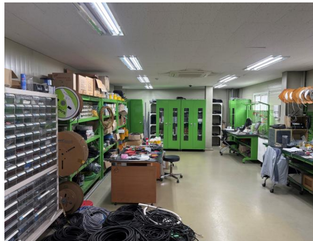
Electrical assembly Room