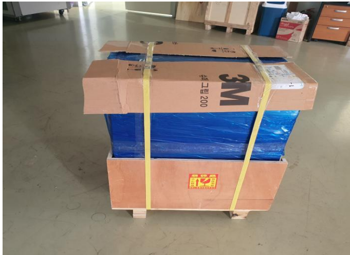
2 nd Damage prevention packaging