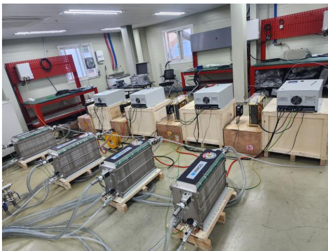
Plate-type discharge tube assembly Room