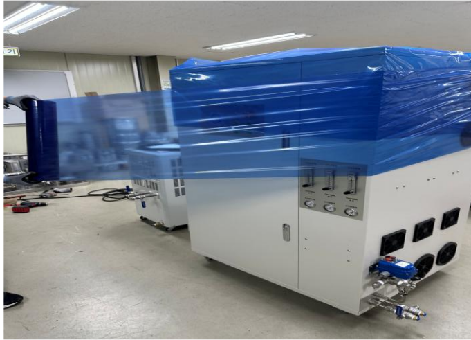
1 st Packaging