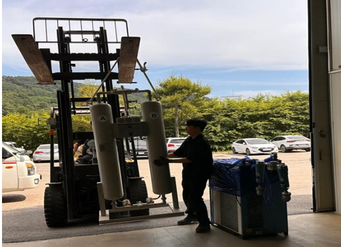
Receiving materials and parts