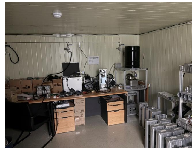
Oxygen Generator manufacturing Room (Dry & Clean Room)