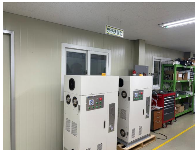
Quality inspection Room