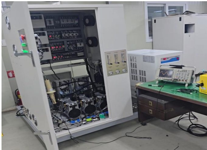
Performance test (O 2 /O 3 concentration)