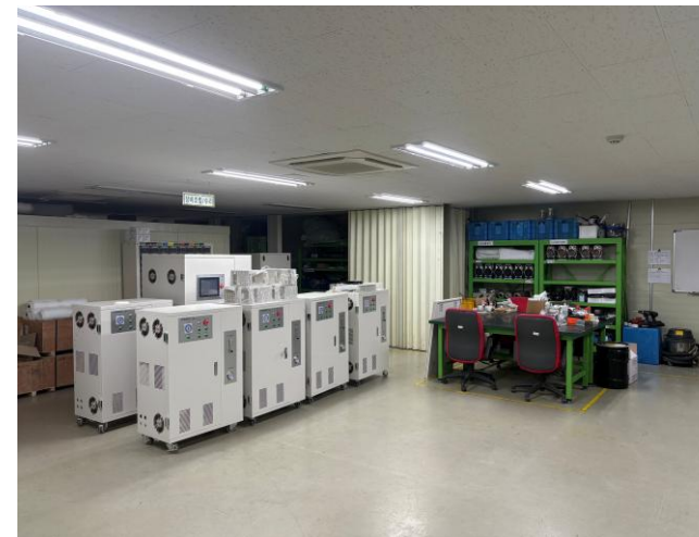
Mechanical equipment assembly Room